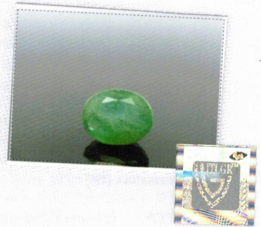
Above picture is not to scale and the colors may differ